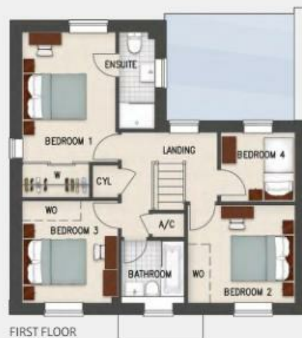
FIRST FLOOR PLOTS: 8 & 15