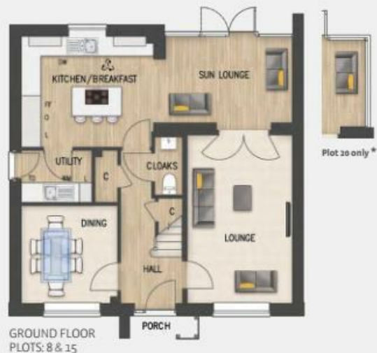
GROUND FLOOR PLOTS: 8 & 15